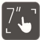
7-inch Touch Screen